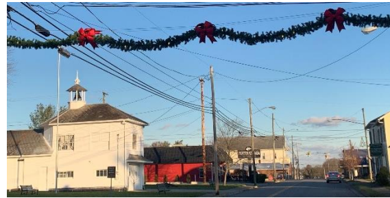
New decorations adorn E. and W. Market St. in 2021