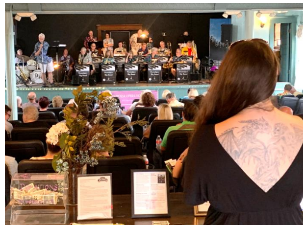
The Nostalgics bring the swing to the Victoria Opera House stage.

The Nostalgics, a swinging big band from Lancaster enjoy playing their vintage classics in a vintage venue. We are grateful for their ongoing enthusiasm, and we are eagerly anticipating their June 12 show. Join the band for rousing renditions of your big band and show favorites. Tickets for the 3 PM show are just $5 on our website or at the door.