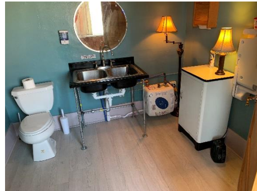
Check out the restroom renovations at the Victoria Opera House! Before (top) and after! Now with slow closing lid!

The Baltimore Bulletin is a periodic publication of the Baltimore Downtown Restoration Committee, a volunteer run 501 (c) 3 non-profit organization. Contact us at: PO Box 74, Baltimore OH, 43105.