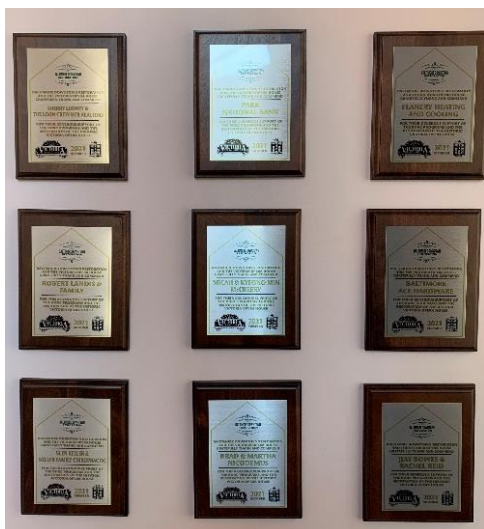
Plaques in the Opera House recognize sustaining members & sponsors.

Memberships are available at different levels. We also have multiple opportunities to sponsor our events. Anyone who contributes $500 or more per year through membership or event sponsorship will have an annual recognition plaque hung in the Victoria Opera House!