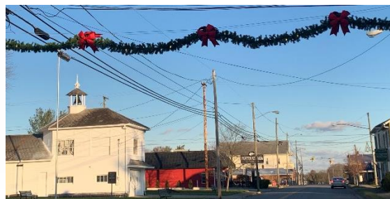
New decorations adorn E. and W. Market St. in 2021.