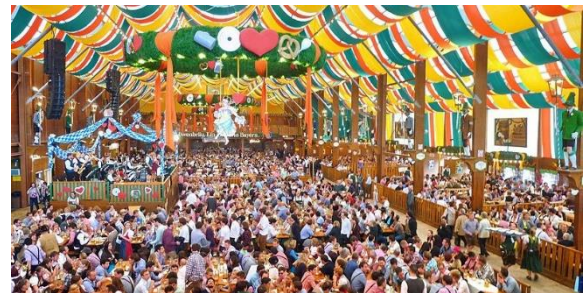
A beer garden tent (for illustration only – Not to scale and NOT the tent we'll have in Baltimore).

The Baltimore Festival Committee puts on a great show for the community every August. This year, the BDRC will be sponsoring and operating the beer garden at the Festival on August 5 & 6. Please plan to stop by and visit for a spell during the Festival and concerts. Every quaff you take supports the BDRC's work and programs, so it's truly a win-win! We'll see you there!