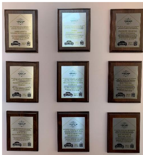
Plaques in the Opera House recognize sustaining members & sponsors.

Memberships are available at different levels. We also have multiple opportunities to sponsor our events. Anyone who contributes $500 or more per year through membership or event sponsorship will have an annual recognition plaque hung in the Victoria Opera House!