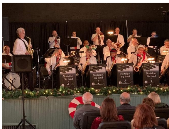
The Nostalgies holiday show at the Victoria Opera House last December was a yuletide delight!

The Nostalgies, a swinging big band from Lancaster enjoy playing their vintage classics in a vintage venue. We are grateful for their ongoing enthusiasm, and we are eagerly anticipating their June 12 show. Join the band for rousing renditions of your big band and show favorites. Tickets for the 3 PM show are just $5 on our website or at the door.