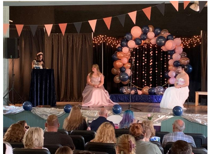
Miss Baltimore candidates on stage for Q&A