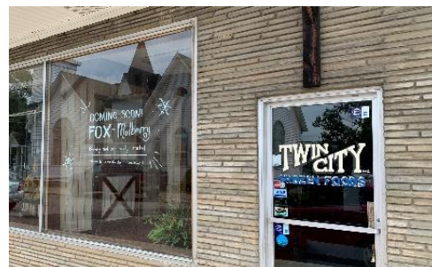
The old Twin Cities building will soon be the Fox + Mulberry bakery & community market thanks to owner Beth Volpe