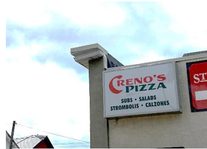
Creno's Pizza, coming on N. Main

Other eagerly anticipated openings include Creno's Pizza on N. Main St., The Farmhouse Café on W. Market St., and Fox + Mulberry (a bakery) at 114 W. Mulberry St.