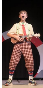
Patrick (above) with the Sardines, Squidward, and Spongebob