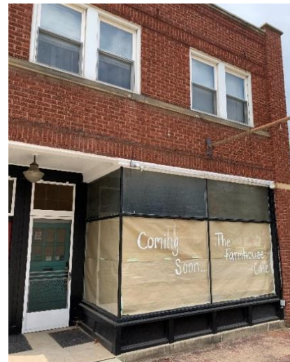
The Farmhouse Cafe undergoing renovations on W. Market Street