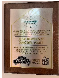
Sustaining Member plaque in the Victoria Opera House foyer.