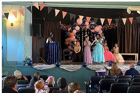
A full house for the pageant

Once upon a time (decades ago), Miss Baltimore was crowned in the Opera House. We are delighted that the tradition has been renewed. The Victoria hosted the Queens Pageant at the end of July, and all the entrants did a fantastic job. However, the winners of all three age groups are UNKNOWN as of press time. The results are announced on the first day of the Baltimore Festival. Congratulations to all who competed, and many thanks to last year's Queens and courts for all the help they have provided to the BDRC over the past year.