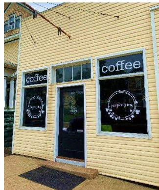
Juniper & Ivy is now open

You've probably noticed the signs and notices around town... several businesses "opening soon". But everything takes time. Congratulations to the first new business to open recently,