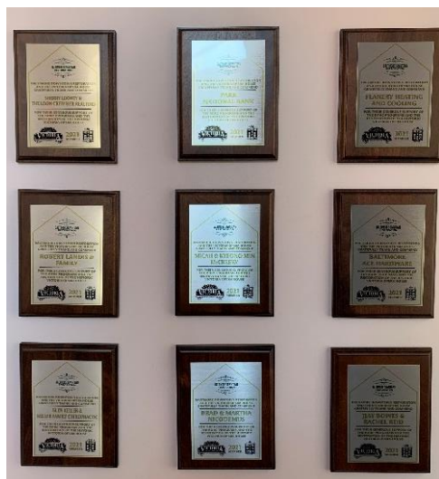
Plaques in the Opera House recognize sustaining members & sponsors.

Members are always welcome at our Board meetings (7 PM on the 3 rd Thursday of each month). Memberships are available at different levels. Anyone who contributes $500 or more per year through membership or event sponsorship will have an annual recognition plaque hung in the Victoria Opera House!